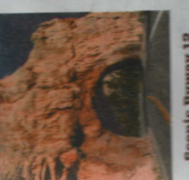
Scenic Byway 12