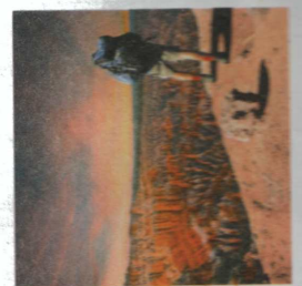
Bryce Canyon National Park

Featuring National Scenic Byway 12-An All-American Road and National Scenic Byway 143-The Patchwork Parkway