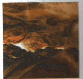
Grand Staircase-Escalante National Monument