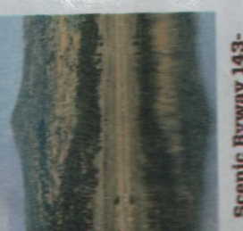
Scenic Byway 143-Panguitch Lake