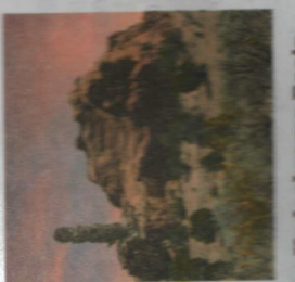
Kodachrome Basin State Park